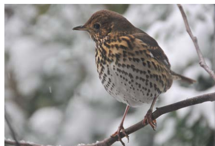
Winter brings out a beauty we can't help but admire.

As a South African, snow is still somewhat of a novelty. Snow is just beautiful, when it is white and fresh and dry. Forget for a second the slush. Forget also the traffic and flight disruptions. For the purpose of this letter, slush is not part of the equation. White flakes, dry, light and beautiful. As they collect, without producing any noise. It changes the landscape in no time.