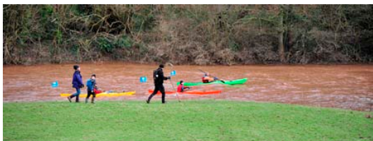
Surprised hikers watch the kayakers shoot by on the final stretch towards Monmouth.

Adventists collecting money for humanitarian aid around the world, we wanted to do something different to launch the celebrations with a bang!"