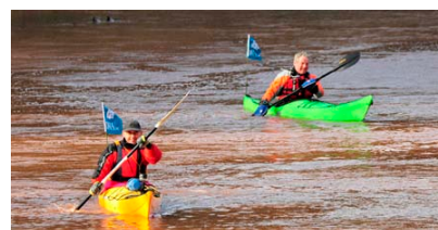
Flying the flag for ADRA.