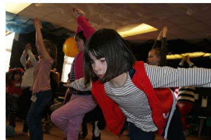
Free form balancing

and grandparents found their places in the church space and settled in to enjoy what their children had been talking about so energetically all week. With nearly every available seat taken up