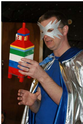
Buzz Brain checks the contents of his space capsule!

A Holiday Bible Club around the theme of 'Space Academy' brought an astonishingly high response from the local community in Weston-Super-Mare – a response that grew higher on the Sabbath morning.