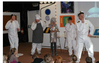
The drama team: 'Someone please think of something!'