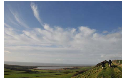
Climbing above the mud, the day ends with blue skies and stunning views.

"Then I started holidaying in Port Ban with others from the Scottish Mission, and he felt he was missing something, so he