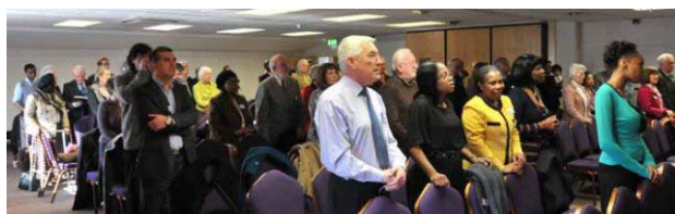
Participants at the 2012 convention rapidly reserving their space for February 2013.

One of the most challenging places to witness is at work - yet as a Christian in business it is also a great opportunity. How can that witness be enhanced? Are there ways we can share ideas together and so make a more significant difference 'in the marketplace'?