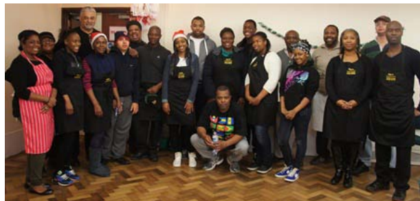
Big smiles on the faces of Christmas day volunteers

The project saw over 63 male and female users accessing the facilities and services. The Advent Shelter provided different activities and facilities for their guests during their week stay: a movie room, a games room, access to computers, a barber service and hairdressing salon provided by volunteers from area 6D. They had access to shower facilities and could have a change of clothing and shoes, alongside breakfast, lunch and dinner. There were two health checks which involved a prostate specific antigen test, blood sugar and blood lipids and one visit by a dentist. As a result Dr Nelda will be commencing a monthly drop-in centre for the guests.